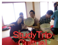
Study Trip Cultural Experience